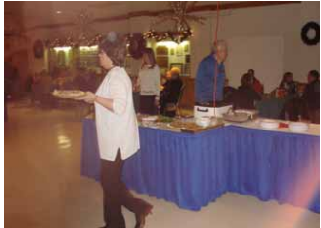
Officers of tthe Post and Auxiliary celebrate the Season with the members of the Post at the Christmas Party