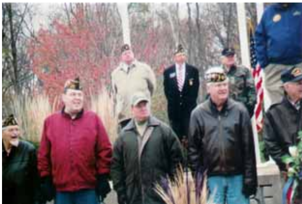
Veterans Day at Veterans Park.