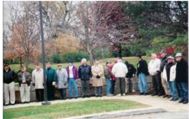
Veterans Day ceremonies at Veterans Park on November 11 included a fine showing of area Veterans.