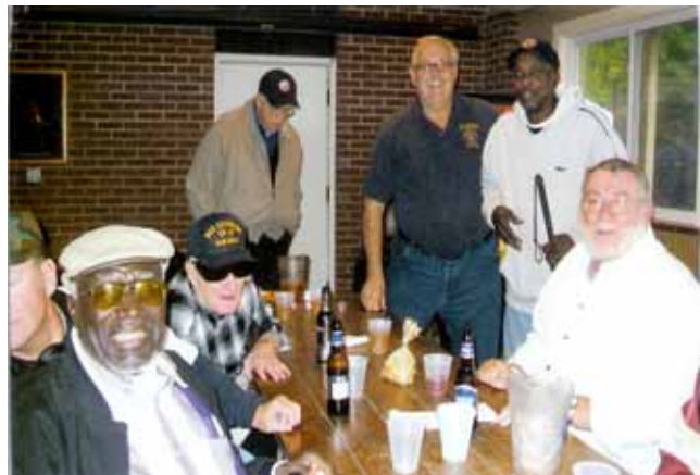
October Fest at our Post. The blind unit from Hines Hospital came to enjoy the camaraderie, festivities and the food.