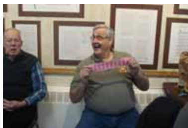
So this is what the winning tickets look like!

Thanks to everyone who volunteered their time to help out with the ham raffle. Thanks also to those who invited their friends and neighbors to come down.